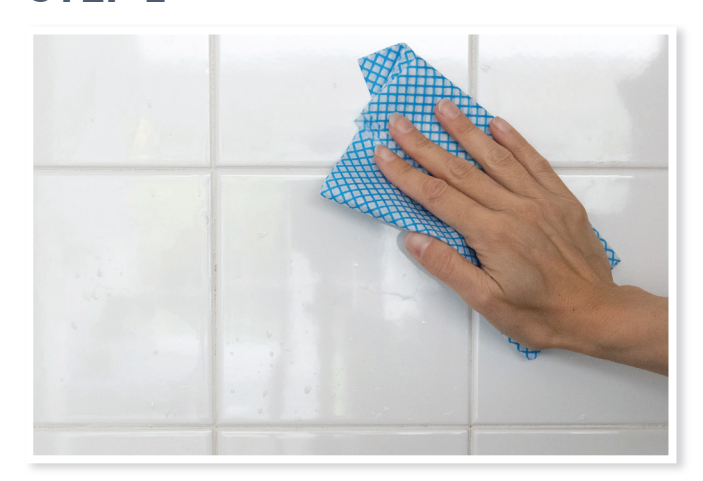
Clean the surface thoroughly to remove any grease or dirt.