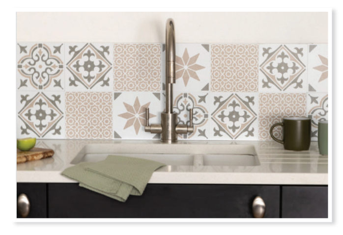
Mix & match to create your own look!