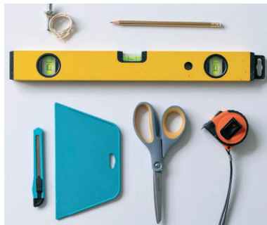
Tools for the job.