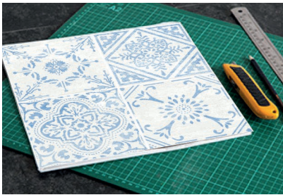
Tools for the job !