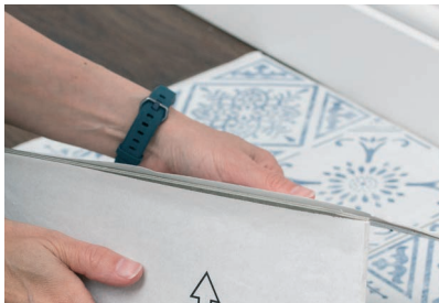
Snap the tile back to remove the cut piece