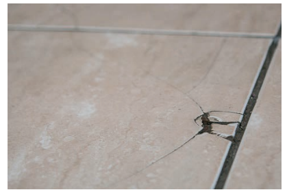
Fill any gaps or recessed grout lines to make the surface completely flat