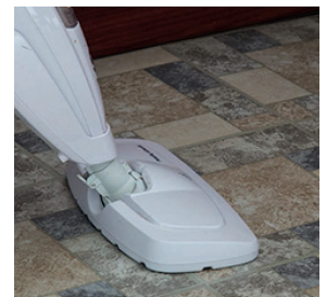
Vacuum cleaners are fine to use too! Caution - Take care with sharp objects!