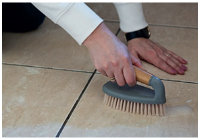
Clean surface to remove any dirt and dust.