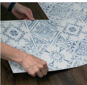
Butt join the tiles and stick to the floor