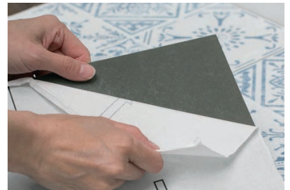
Peel away the backing paper