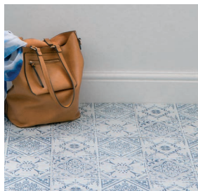
Allow 24 hours for the adhesive to bond