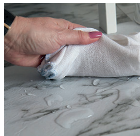
The vinyl floor tiles can be cleaned easily using normal household cleaners